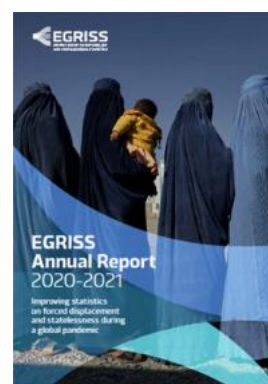
Annual Report 2020–2021