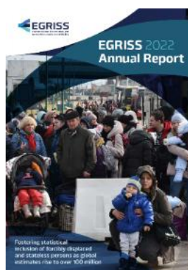
Annual Report 2022