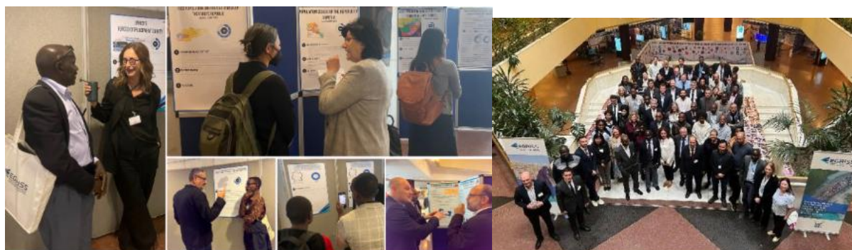
EGRISS 2022 All Members Meeting

The 2025 meeting will serve as a comprehensive stocktaking of progress vis-à-vis the Group's existing goals and a critical planning summit to further embed displacement and statelessness statistics in national and global statistical systems. By convening EGRISS members at the tail end of the Group's current mandate and in advance of submitting its official report to the UNSC in 2026, the event offers a platform for members to share experiences implementing the Recommendations and pursuing statistical inclusion of refugees, IDPs and stateless populations from various national, regional and global vantage points. Based on this, participants will have the opportunity to shape an ambitious but realistic outlook for the Group's work in subsequent years, reinforcing the shared commitment to leave no one behind.