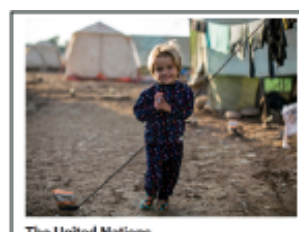
The United Nations

The UN Secretary General launched his Action Agenda on Internal Displacement as a response to the rise of internal displacement crises worldwide. The document highlights the need to put in place relevant